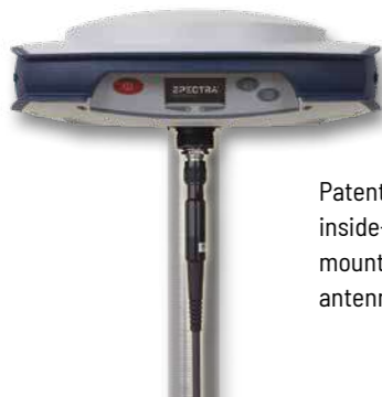
Patented inside-the-rod mounted UHF antenna design